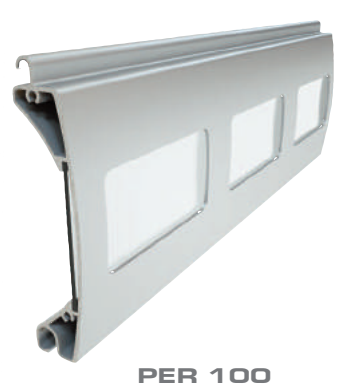
Profile height 100mm Thickness 25mm Max width 7000mm