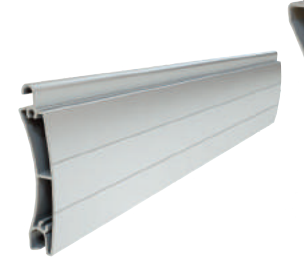
Profile height Thickness Max width Max surface 55mm 14mm 6500mm 15m²