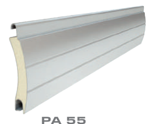
Profile height 55mm Thickness 14mm Max width 3000mm Max surface 9.5m²