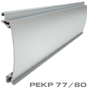
Profile height 77/80mm Thickness 18.5mm Max width 6000mm