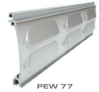
Profile height 77mm Thickness 14.5mm Max width 6000mm