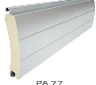
Profile height 77mm Thickness 18.5mm Max width 6000mm Max surface 15m²