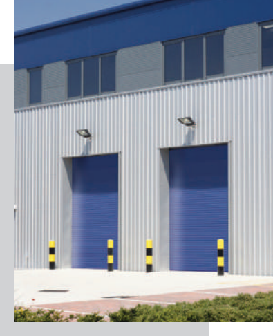
Security and day-in, day-out durability are standard ALUPROF features.