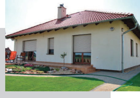
Your customers and your business are in the safest of hands with ALUPROF.