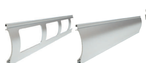
Profile height 52mm Thickness 13mm Max width 3000mm Max surface 10m²