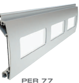
Profile height 77mm Thickness 18.5mm Max width 6000mm