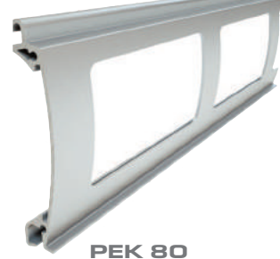
Profile height 80mm Thickness 18.5mm Max width 6000mm Max surface 15m²