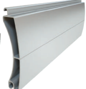
Profile height 100mm Thickness 25mm Max width 7000mm Max surface 31.5m²